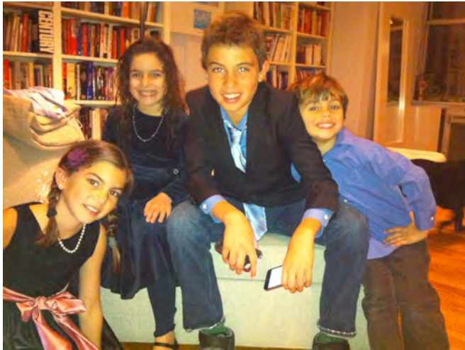
Cousins NYC Wedding Rehearsal Dinner